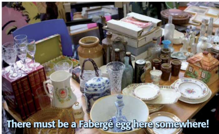
There must be a Fabergé egg here somewhere!

These will commence in April, on Sunday 3rd and will continue until October on the first Sunday of each month. See page 4 for all the other dates.