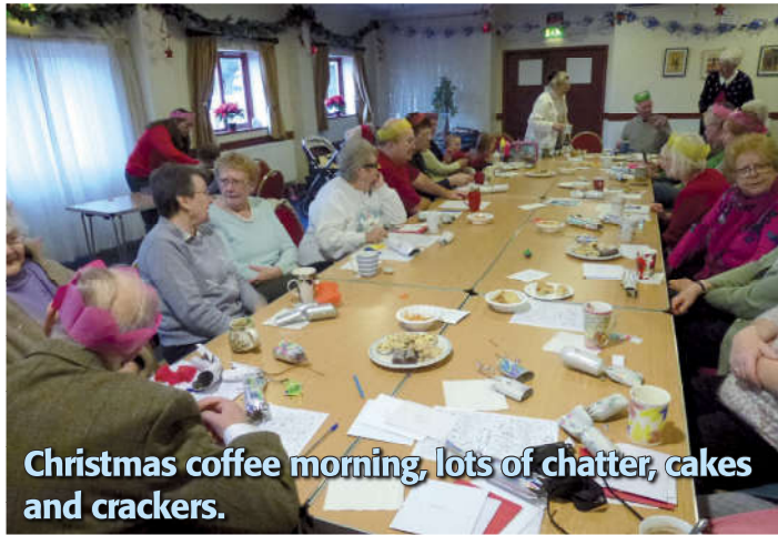
Christmas coffee morning, lots of chatter, cakes and crackers.